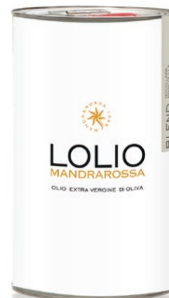
BLEND Tin 5l