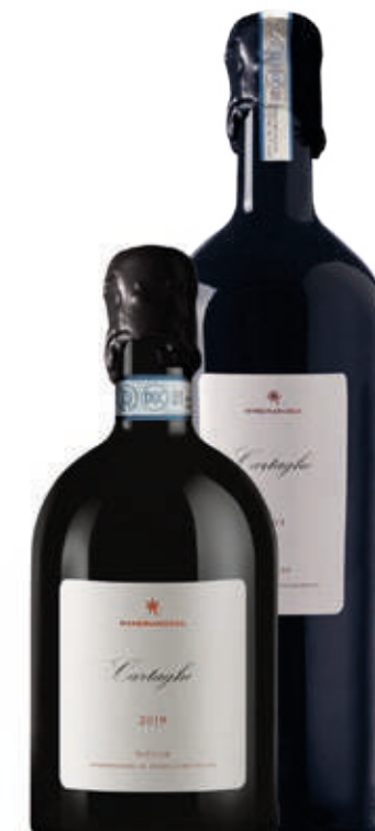
CARTAGHO Barilotto 1,5l Jéroboam 3l