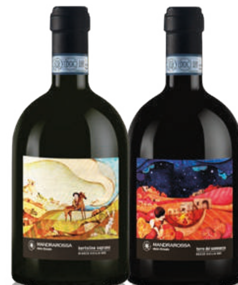
BERTOLINO SOPRANO Barilotto 1,5l