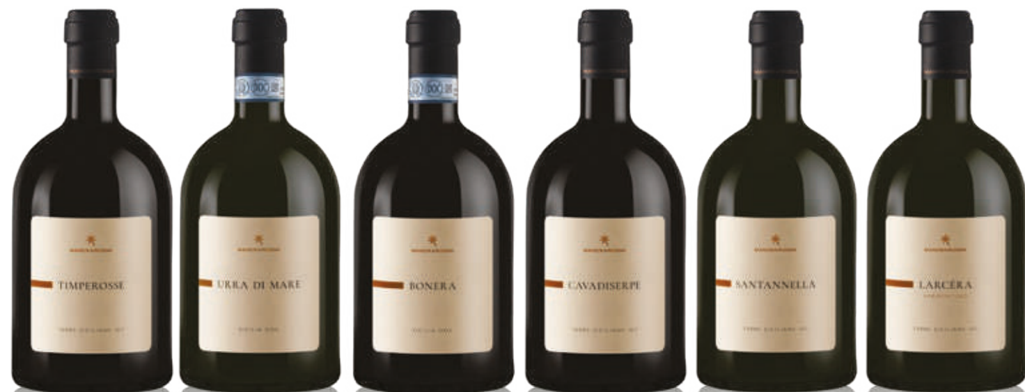
TIMPEROSSE Barilotto 1,5l