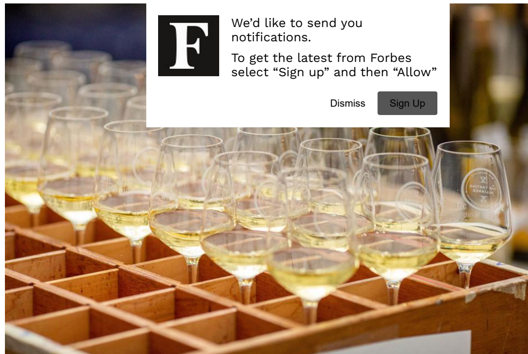
Samples of white wines awaiting judging at the 2021 SFIWC

The Best Chardonnay, 94 points, Double Gold medal, was the Trentadue Winery 2020 La Storia Chardonnay, Russian River Valley, California, USA, $28 . The tasting note called it: