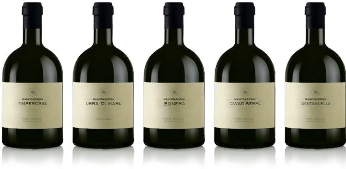
TIMPEROSSE Barilotto 1,5l