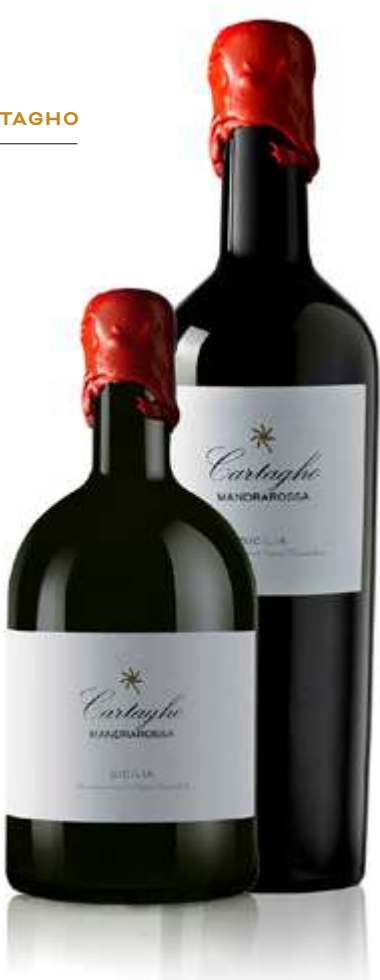
CARTAGHO Barilotto 1,5l Jéroboam 3l