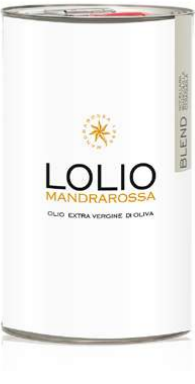
BLEND Tin 5l