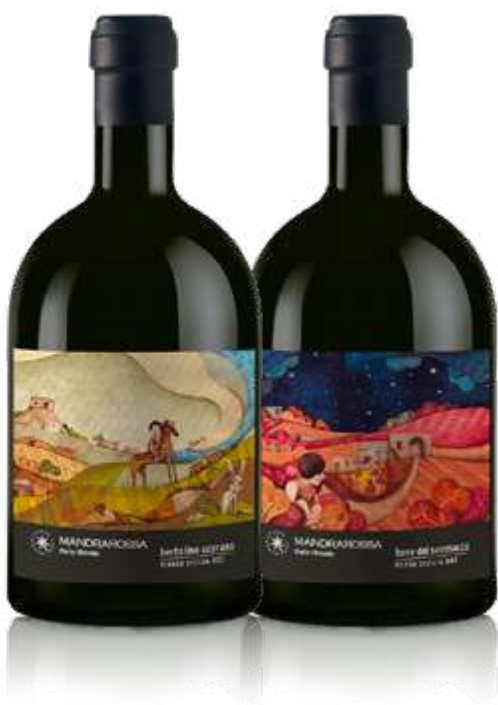
BERTOLINO SOPRANO Barilotto 1,5l