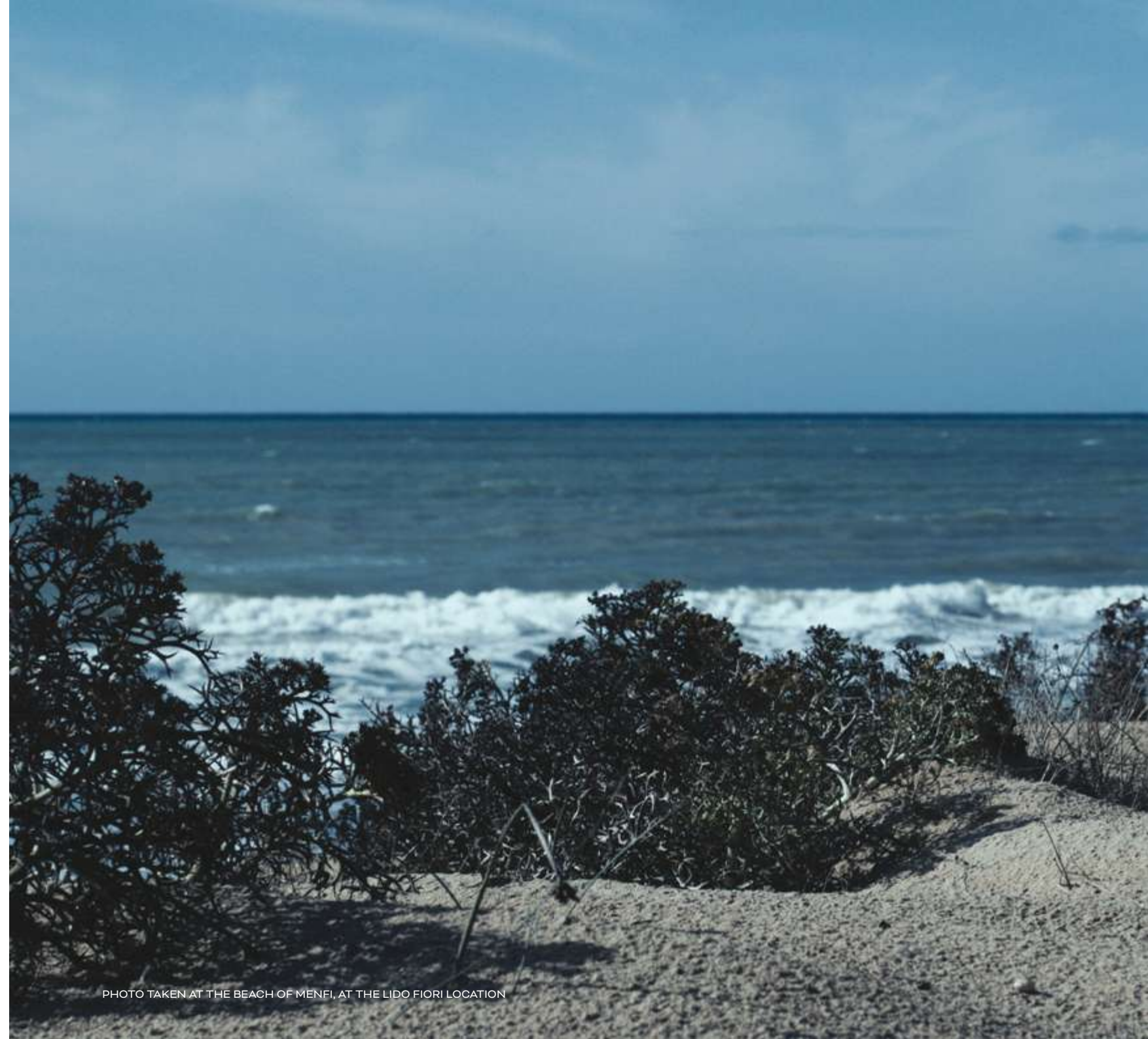
PHOTO TAKEN AT THE BEACH OF MENFI, AT THE LIDO FIORI LOCATION

FROM THE UNCONTAMINATED LANDS OF SOUTH-WESTERN SICILY, TO THE BLACK SANDS OF THE TALLEST VOLCANO IN EUROPE, REACHING THE ROCKY COASTS OF AN ISLAND CONSTANTLY CARESSED BY THE WIND, MANDRAROSSA'S SICILY IS NOW REPRESENTED BY THREE TERRITORIES STRONGLY SUITABLE FOR VITICULTURE: MENFI, ETNA AND PANTELLERIA.