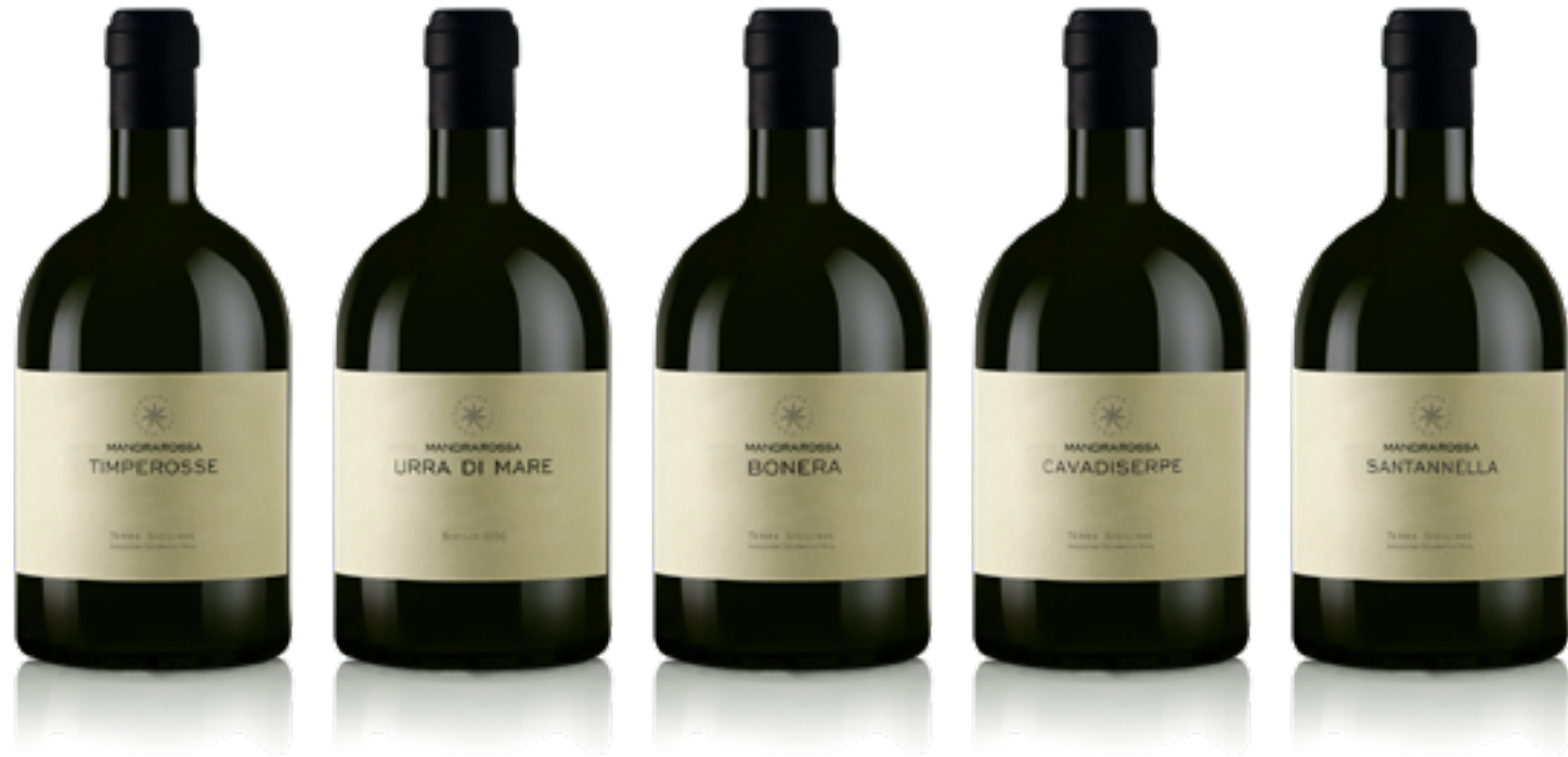
TIMPEROSSE Bariotto 1,5l