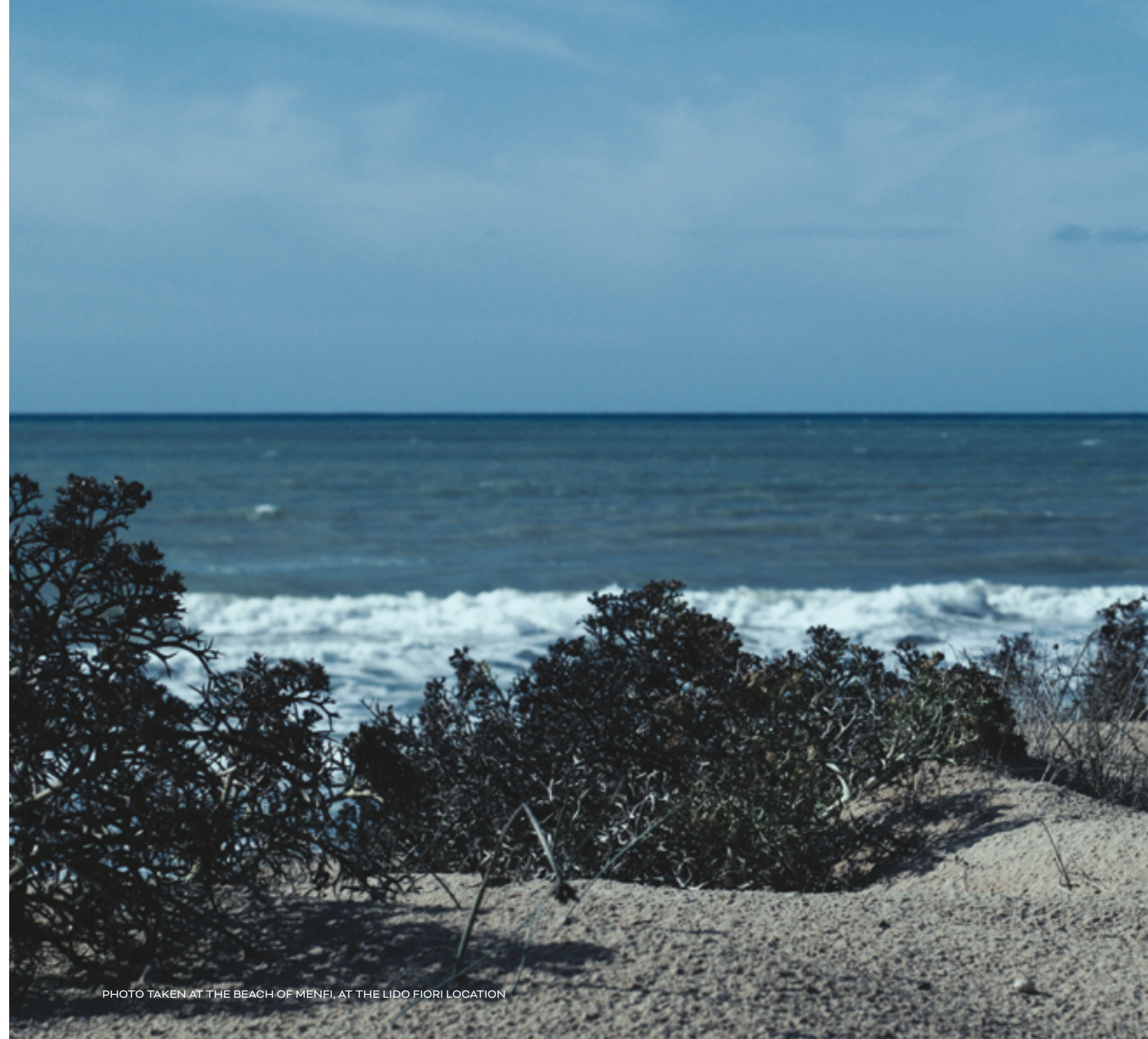
PHOTO TAKEN AT THE BEACH OF MENFI, AT THE LIDO FIORI LOCATION

FROM THE UNCONTAMINATED LANDS OF SOUTH-WESTERN SICILY, TO THE BLACK SANDS OF THE TALLEST VOLCANO IN EUROPE, REACHING THE ROCKY COASTS OF AN ISLAND CONSTANTLY CARESSSED BY THE WIND, MANDRAROSSA'S SICILY IS NOW REPRESENTED BY THREE TERRITORIES STRONGLY SUITABLE FOR VITICULTURE: MENFI, ETNA AND PANTELLERIA.