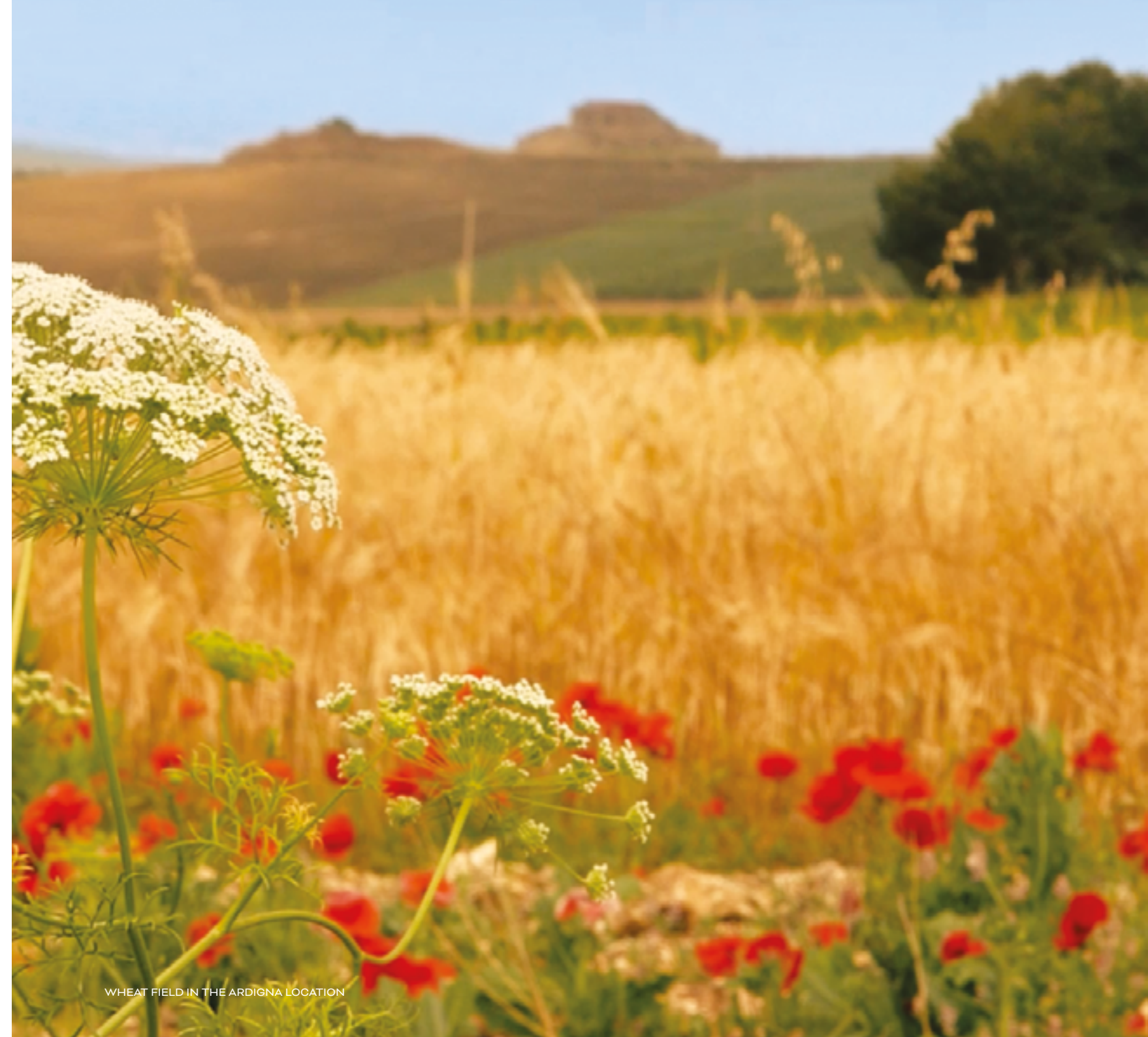
WHEAT FIELD IN THE ARDIGNA LOCATION

PAIRINGS Fish-based dishes, first courses and seafood.