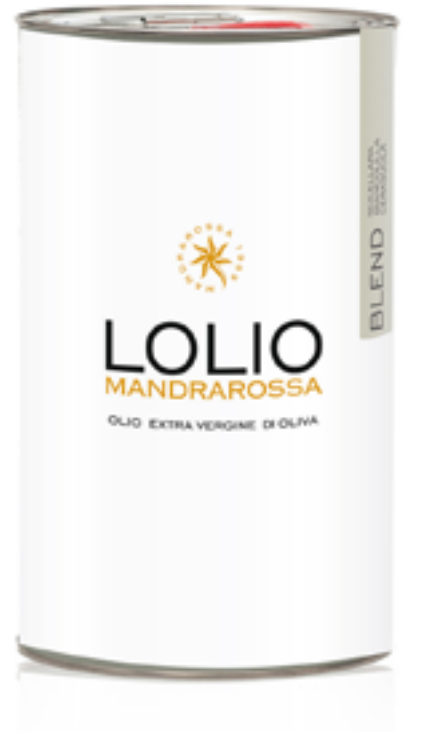
BLEND Tin 5l