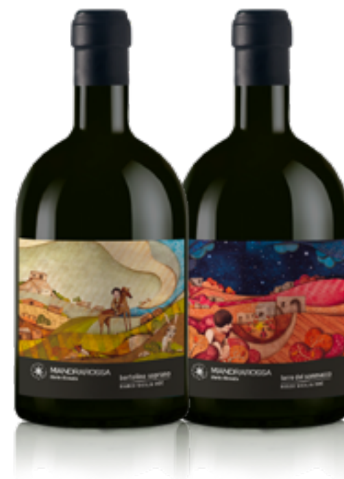
BERTOLINO SOPRANO Bariotto 1,5l