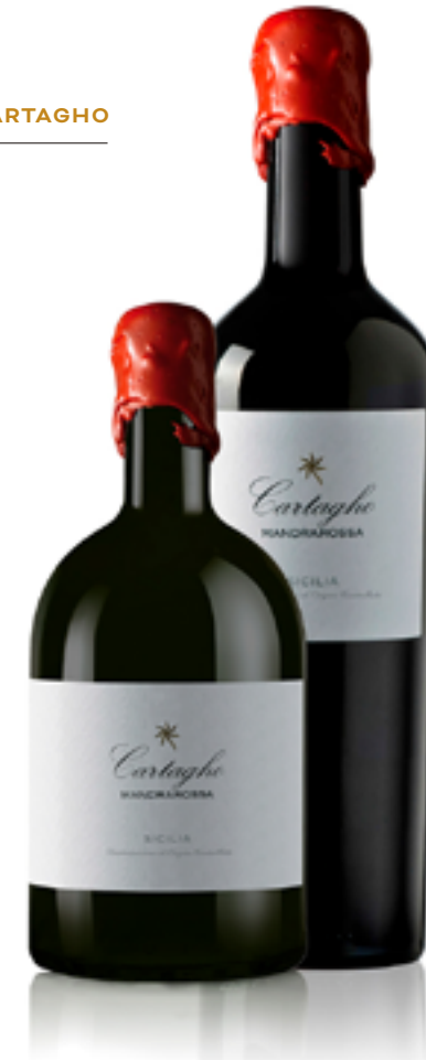
CARTAGHO Bariotto 1,5l Jéroboam 3l